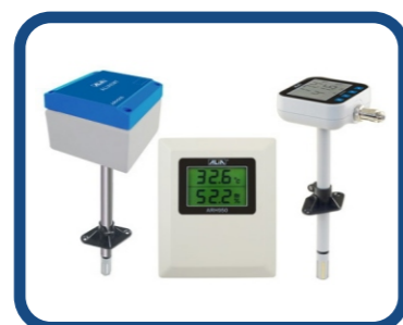
Humidity and Temperature Transmitter ARH950