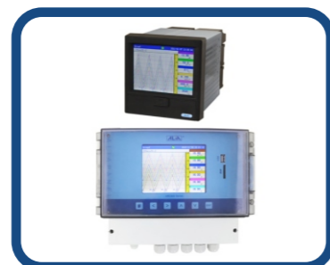
Paperless Recorder ARC900