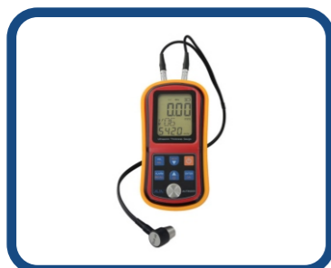
Ultrasonic Thickness Gauge AUT8500