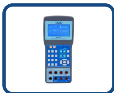
Multi-Function Calibrator ACA60