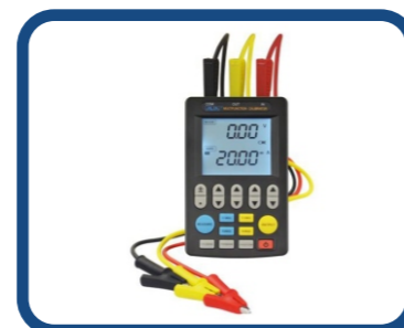
Multi-Function Calibrator ACA50