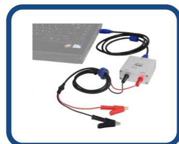
Smart HART Communicator AHT520