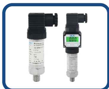
Pressure Transmitter APT3000