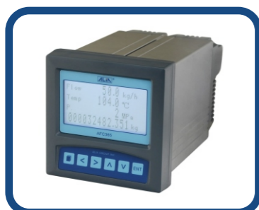
Flow Computer AFC365