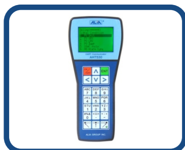
Portable HART Communicator AHT530