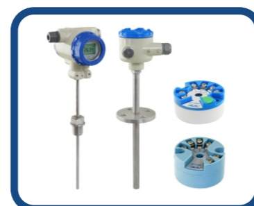
Smart Temperature Transmitter ATT1000