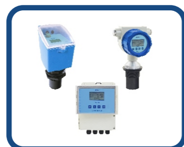
Ultrasonic Level Transmitter AUL730