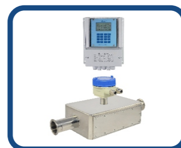
Sanitary Type Ultrasonic Flowmeter AUF770