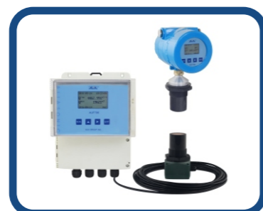
Ultrasonic Open Channel Flowmeter AUF790