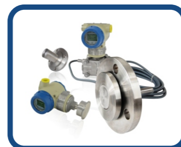
Direct-Mount / Remote Diaphragm Seal ADP-D