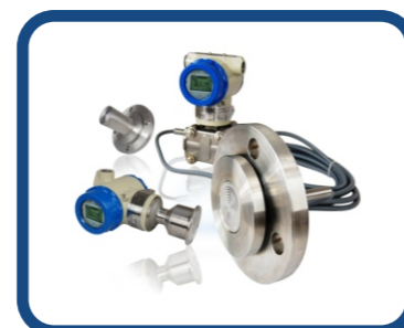
Direct-Mount / Remote Diaphragm Seal ADP-D