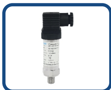
Pressure Transmitter APT3000