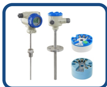
Smart Temperature Transmitter ATT1000