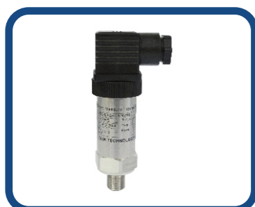
Pressure Transmitter APT3000