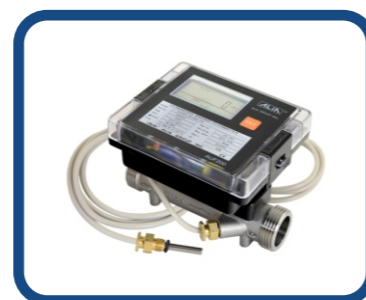
Ultrasonic Energy Meter AUF200