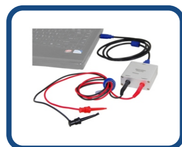
Smart HART Communicator AHT520