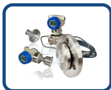
Direct-Mount/Remote Diaphragm Seal ADP-D