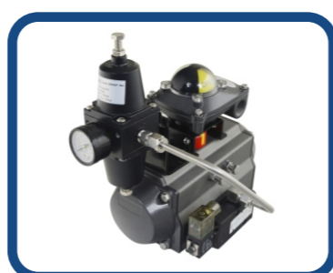
Damper Actuator ADA360