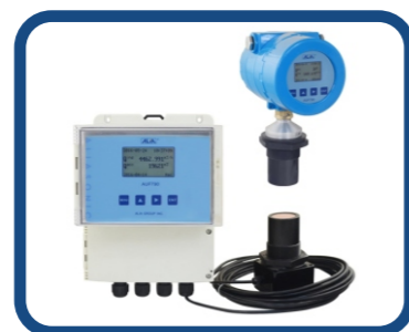
Ultrasonic Open Channel Flowmeter AUF790